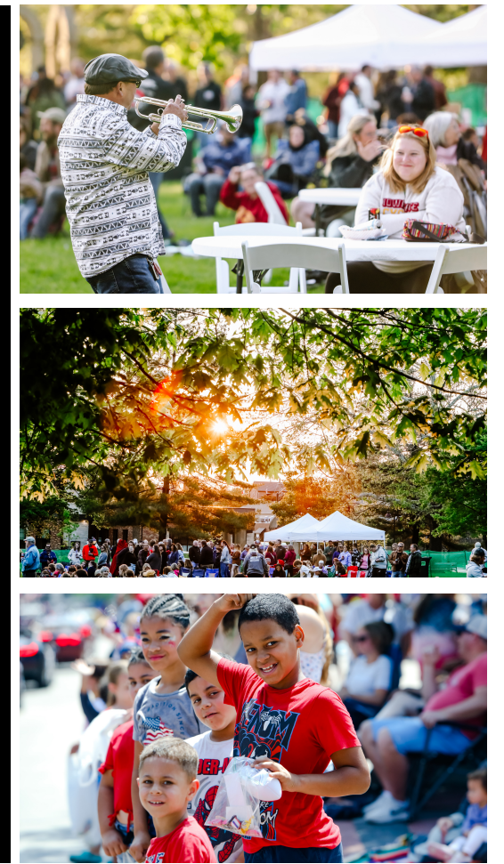
RAGBRAI - The party of the year took place in July when the Register's Annual Great Ride Across Iowa stopped overnight in Ames. In the evening, Main Street was packed with riders and community members as Hairball took the stage for the evening entertainment.