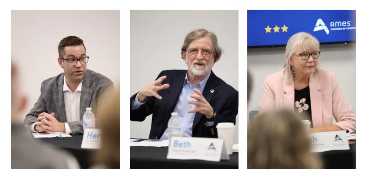
The April 2023 Legislative Update featured a panel of local legislators including Senator Jesse Green, Senator Herman Quirmbach, and Representative Beth Wessel-Kroeschell.

Public Policy related events including the inaugural lowa Congressional Staff Visit and the Washington D.C. Fly-in events.