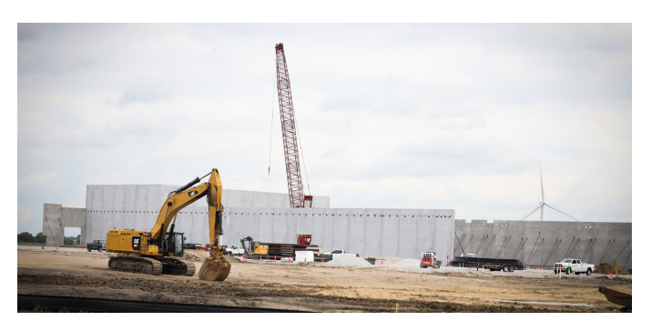
Wyffels Hybrids began construction in Prairie View Industrial Center on their new warehouse and distribution center. They plan to begin shipping from the Iowa site in 2024.